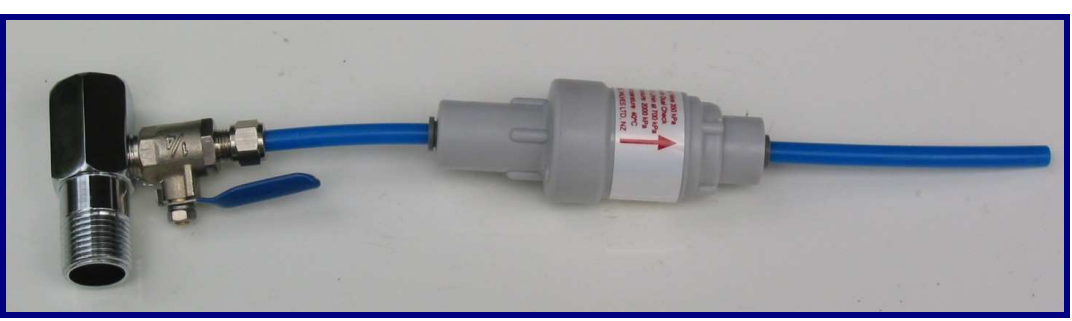
Note: Parts & Components may vary. This picture is for display purposes only.

2 The PLV <u>(When supplied)</u> is an inline application. Place the PLV in line from the water supply to the first filter. This will provide 350 kpa protection to the filter system. (Refer to the picture provided below)